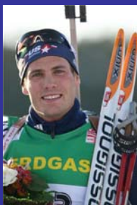
As the first American biathlete to wear the yellow bib, it is hoped that Tim Burke will win the first U.S. Olympic medal in biathlon.

leading or chasing Bjørndalen across the finish line in any of the competitions. He completed his pre-Olympic competition period with two wins in the Ruhpolding World Cup Sprint and Mass Start races and goes to Whistler as a co-favorite with the potential to take home several medals. The two Norwegians are joined on the team by the veteran 1998 Gold medalist, 40 year-old Halvard Hanevold and two-time Gold medalist at the World Cross-Country Championships, Lars Berger. The Norwegian men's team will definitely be a factor in the relay.