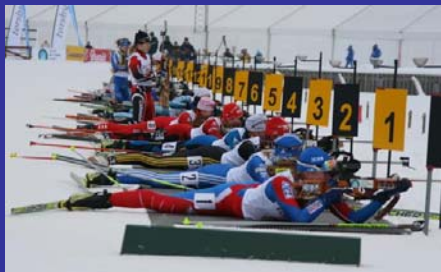
The Youth Women's relay race provided an exciting race on the last day of the World Youth/Junior Championships.