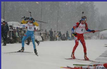
The junior men faced difficult conditions during the Individual race at Torsby, Sweden.