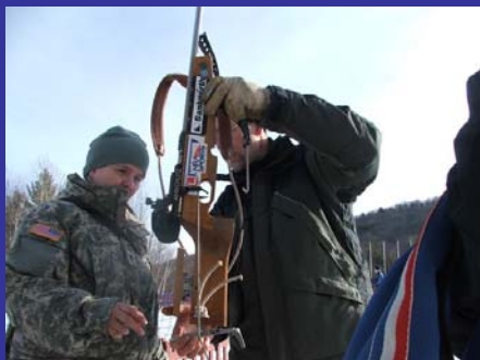
The National Guard snow-making was 24-7 the week before the NorAm 4 races at the Ethan Allen Biathlon Center.

in the Youth women's relay. Russia won the Junior women's race, using only 3 reserve rounds, 29.7 seconds ahead of Norway who also needed only 3 reserve rounds. Norway barely edged out Germany by only two-tenths of a second when Synnøve Solemdal used her superior ski speed to put Germany, Poland and France behind her. The Russian's shooting was not as good for the youth women, needing 12 reserve rounds and could not avoid a trip to the penalty loop. They finished 23.9 seconds behind the Norwegian team that needed only 4 reserves for the win. Belarus finished 3 rd , 40.2 seconds behind the winners. The U.S. team ran into early trouble when Kelly Kjolien needed to make four trips around the penalty loop and the start leg.