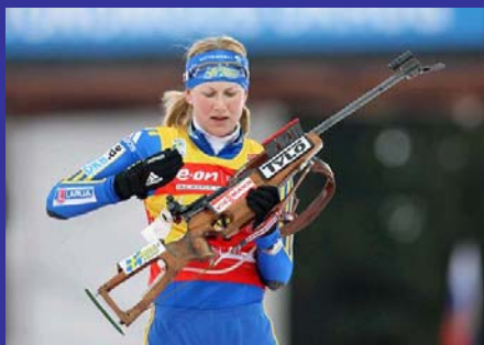
Sweden's Helena Jonsson is the World Cup leader and top candidate for Olympic titles in Vancouver.