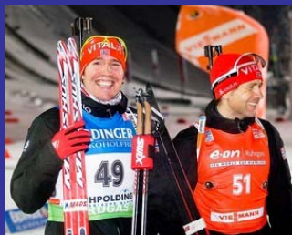
Norwegians Ole Einar Bjørndalen and Emil Hegle Svendsen are predicted for multiple Olympic medals.